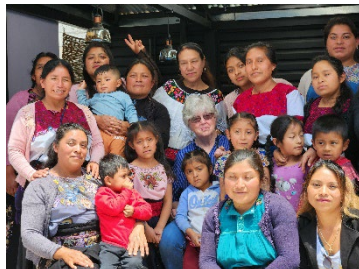
Cooperative members April 2024

Donations may be given through our website or by mail to: Mujeres De Maiz Opportunity Foundation, P.O. Box 1954, Sequim, WA 98382