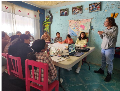
Workshop for scholarship recipients Dec. 2023

Donations may be given through our website or by mail to: Mujeres De Maiz Opportunity Foundation, P.O. Box 1954, Sequim, WA 98382