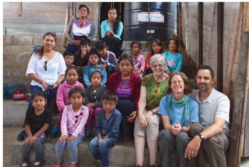
Zinacantan Children's Program July 2018 1

Donations may be given through our website or by mail to: Mujeres De Maiz Opportunity Foundation, P.O. Box 1954, Sequim, WA 98382