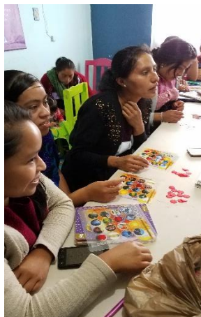
2020 Workshop Icebreaker

Donations may be given through our website or by mail to: Mujeres De Maiz Opportunity Foundation, P.O. Box 1954, Sequim, WA 98382