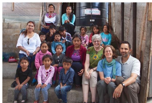
Zinacantan Children's Program July 2018 1

Donations may be given through our website or by mail to: Mujeres De Maiz Opportunity Foundation, P.O. Box 1954, Sequim, WA 98382