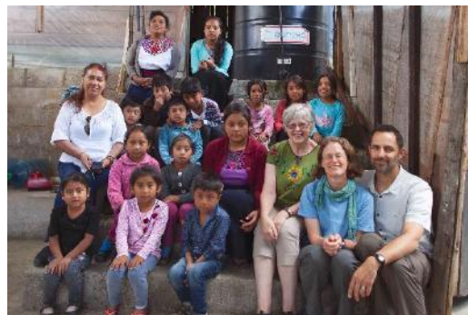
Zinacantan Children's Program July 2018 1

Donations may be given through our website or by mail to: Mujeres De Maiz Opportunity Foundation, P.O. Box 1954, Sequim, WA 98382