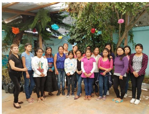
2017 Scholarship recipients

Donations may be given through our website or by mail to: Mujeres De Maiz Opportunity Foundation, P.O. Box 1954, Sequim, WA 98382